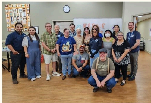
Pictured: Volunteers and organizers at the September 2024 Repair Café at the West University Branch Library -- one of 4 events organized in 2024 by HCPL staff and Harris County Office of Administration - Sustainability staff in partnership with volunteers from the community.

With their Office of County Administration's (OCA) Sustainability Division, the library has conducted repair cafes, waste audits, and has begun the process of establishing multiple library branches as climate resilience hubs. Looking forward in this partnership, HCPL has plans to pilot a composting program in 2025 at several library branches located in or near Justice 40 communities.