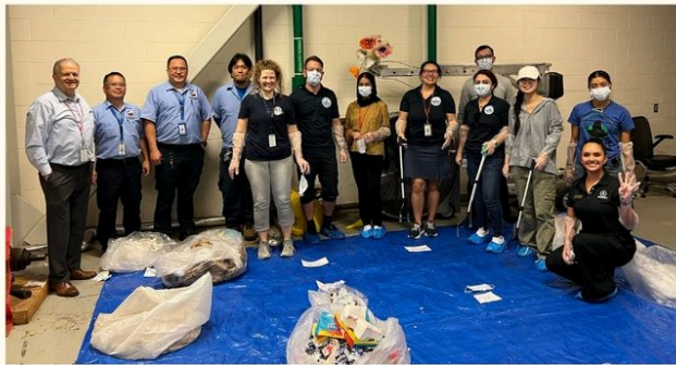
Pictured: Waste audit at the county jail conducted on kitchen waste by staff from various Harris County departments.

Harris County Public Library (HCPL), a 2024 recipient of the National Medal for Museum and Library Service, has found benefit in their extensive community partnerships.