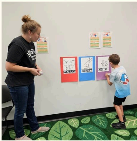
Pictured: Story time conducted at the Octavia Fields Branch by volunteers from League of Women Voters of Houston

Another partnership bringing many benefits to the HCPL community is the library's partnership with the League of Women Voters of Houston (LWVH). Working together, the organizations provide story times, voter education, and voter registration. Additionally, HCPL became the first library system in the country to provide access to their local League of Women Voters Guide on Libby -- doing so equitably by making the content available in both eBook and audiobook format as well as in both English and Spanish.