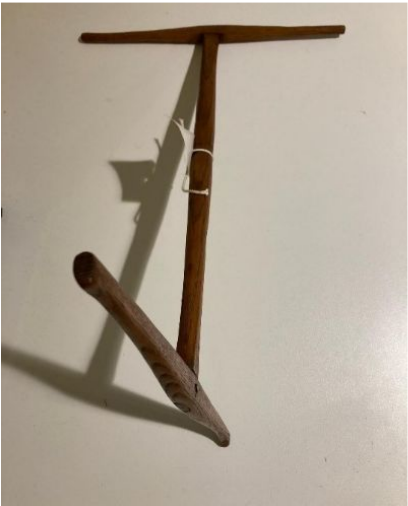
A Niddy-Noddy, used to wind yarn was used in the social media campaign to promote Gardiner's Craft Supply Sale

crafters to downsize their stash and benefit the library (and the environment) at the same time. This year's donated items included supplies for knitting, jewelry making, scrapbooking, sewing, needle crafts, and kids crafting. Local yarn shops and hardware stores also donated to help this fundraiser. Gardiner publicized the event through local news sources and social media. Their Instagram account's numerous "Can you guess...?" posts generated interest and built up the excitement for this event. With a team of volunteers running the event and assisting shoppers, Gardiner raised $11,000.