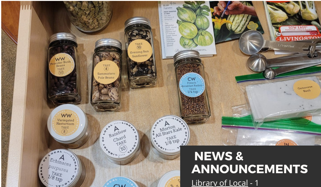
Millbrook Library's Library of Local Seed Library

The latest news and updates from the Sustainable Libraries Initiative