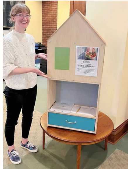
Millbrook Library's Library of Local Display

The Library of Local Project offers essential wisdom, know-how, and tools for local self-sufficiency and community resilience. In 2022, the Library of Local is offering programs and resources addressing the following topics: Regenerative Land Use, Green Building, Renewable Energy, and Climate Change. The Library of Local taps into the powerful connections local public libraries have in their communities to bring a robust schedule of in-person and virtual educational events which are free and open to the public at the libraries below. Library of Local libraries are also developing partnerships with local grassroots environmental organizations to provide meeting and program space, tools, and additional capacity-building resources to help communities work together to mitigate and persevere through the coming effects of climate change.