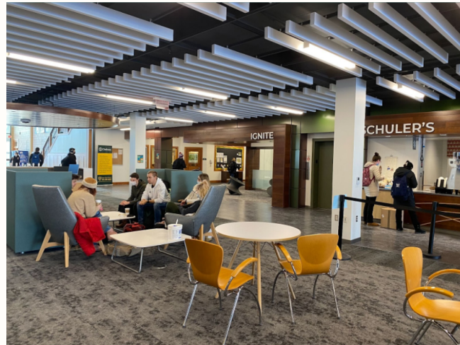
Open floor plan at Clarkson University Libraries.

Embarking in the certification process gave her a chance to look inward at the role that the Clarkson University Libraries takes in their own sustainability efforts and how these actions contribute to the broader campus sustainability efforts. The participation of the Dean of Libraries in many University committees over the past several years has helped to position Clarkson University Libraries as a vital agency in the campus sustainability mission. The committee work and willingness to collaborate on grants has elevated the profile of the library among the other departments on campus and has helped increase the visibility of the library among the faculty and students.