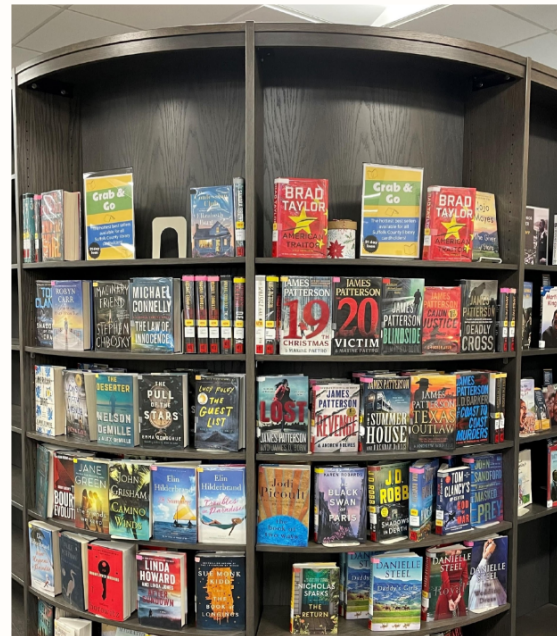
Popular new books are rented at Hauppauge Public Library.

Don't miss our important news: Please add sli-newsletter@lists.suffolknet.org to your address book to keep our newsletter out of your junk or spam folders!