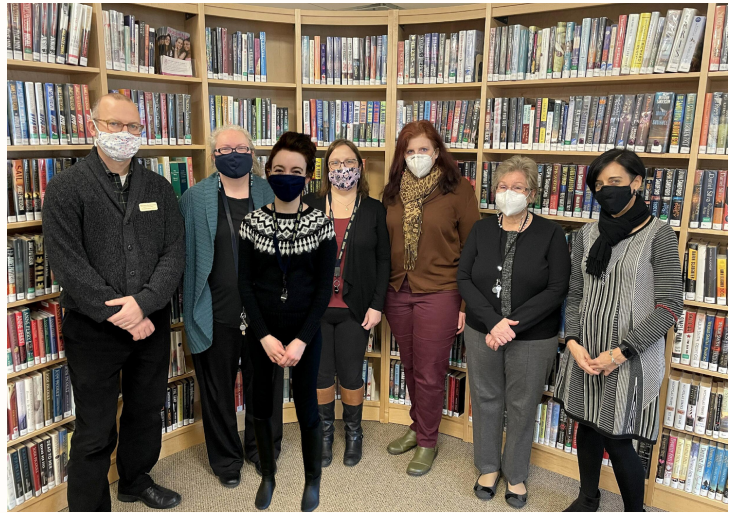
Hauppauge Public Library's Green Team.

Programmable thermostats were installed, Energy Star rated electronics were purchased, and popular titles are rented from vendors, rather than purchased. This allows Hauppauge to meet the demand for new titles, while building in the ability to send them back to the vendor as soon as demand wanes. The staff have access to reusable cups, dishes, and utensils in addition to a dishwasher. The library also has two water bottle filling stations. These are a great service to the public and offer passive reinforcement of the environmental benefit of reducing plastic water bottle consumption.