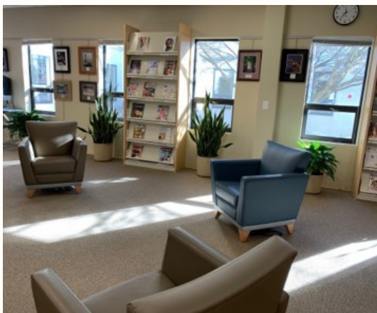
Daylighting used in Hauppauge Public Library.

Many other efforts were smaller in scale and budget, yet still added up to a considerable environmental benefit.