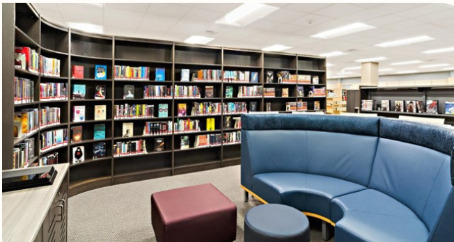
Flexible furniture design used in Hauppauge Public Library.