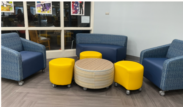
Student sitting area at Schenectady Middle School