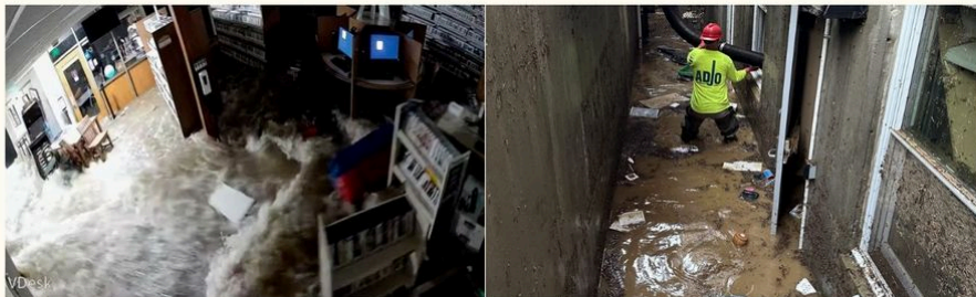
Pictured: In August 2024, a flash flood brought about $10 million in damages to The Smithtown Library including the destruction of several revolutionary-era historical artifacts.

Flood Preparation and Repair Webinar Registration