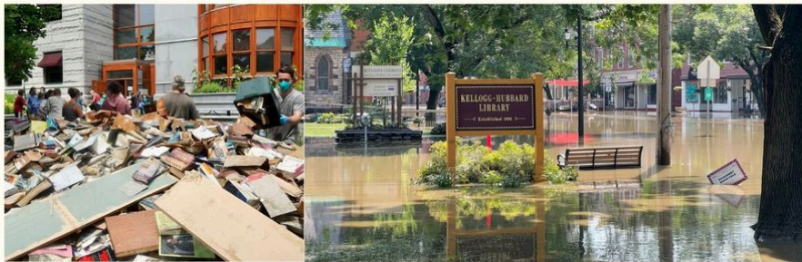
Pictured: A July 2023 flood filled the basement of Kellogg-Hubbard Library with more than 7.5 feet of water, destroying nearly all building systems and causing approximately $2 million in damage.

Learn more about how libraries are leaders in community resilience and click the link below to register!