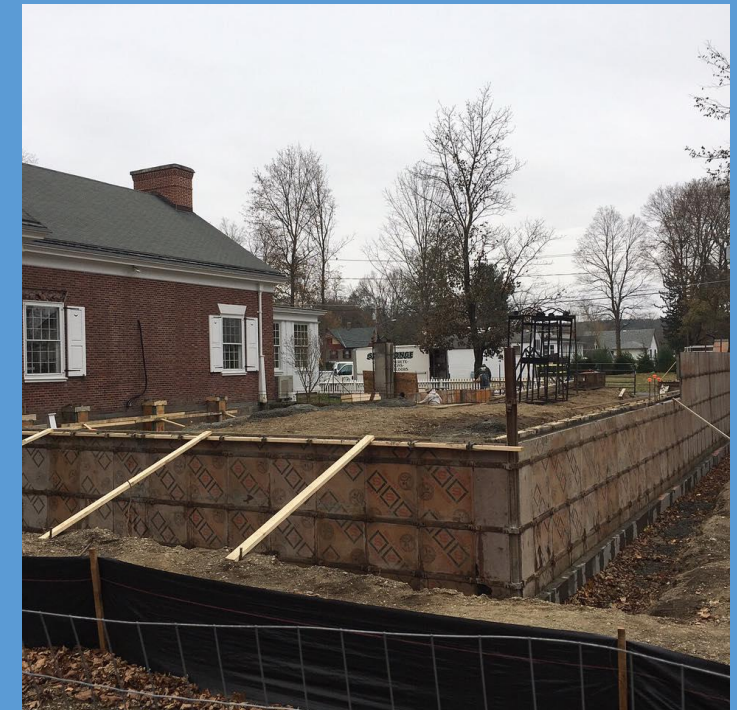
Laying the foundation for the new building - Nov. 2017