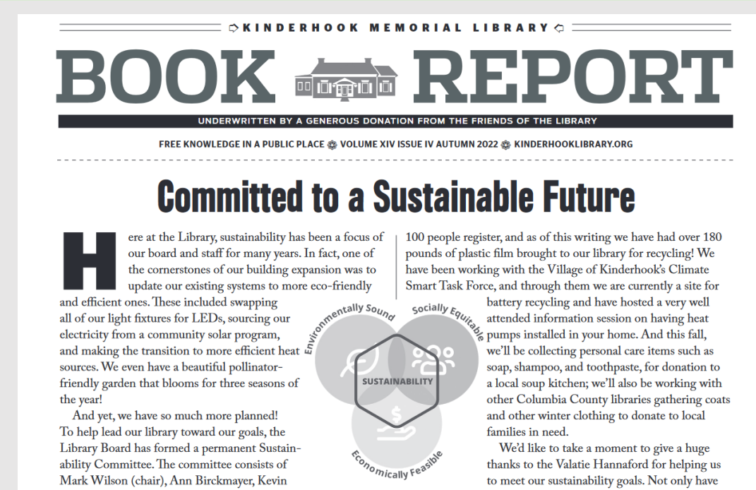
Front page of our Fall 2022 newsletter