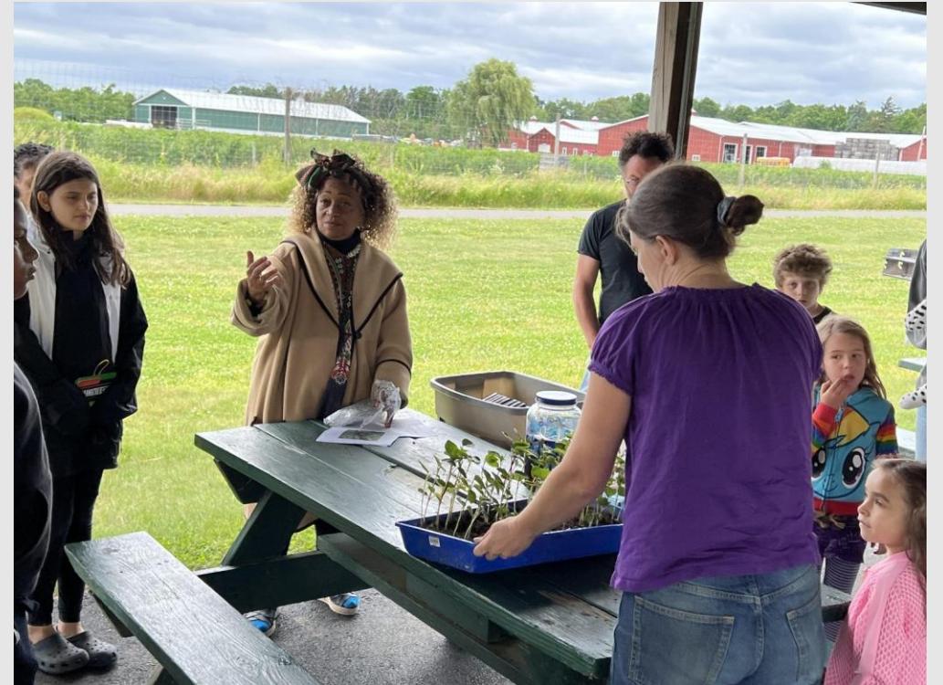
Red hibiscus saplings were available for attendees at our Juneteenth 2022 event.