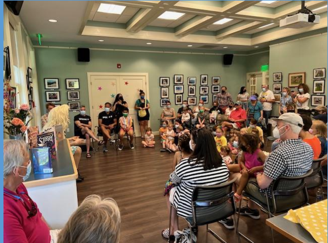
We had a packed house for our third annual Drag Story Hour!